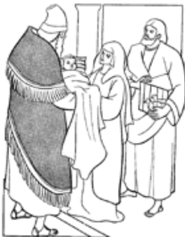
Presentation or Candlemas